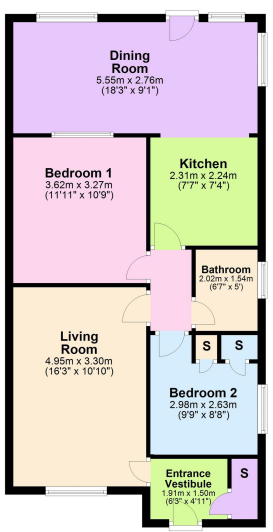
Total area: approx. 72.1 sq. metres (775.9 sq. feet)